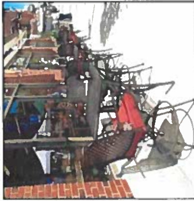
Outdoor dining is arranged to allow a linear 5 foot wide pedestrian clear zone and provides attractive, quality amenities.