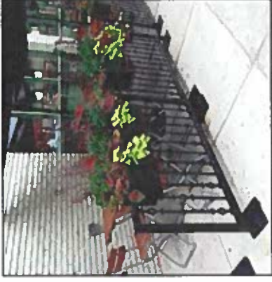
Outdoor dining enclosure utilizes quality materials, creates a sense of privacy with planters, has substantial base plates for stability, and takes up minimal space.