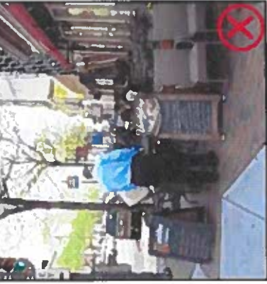
The outdoor dining area blocks the pedestrian clear zone, too many features create visual clutter, and crowding of the dining area detracts from other users.