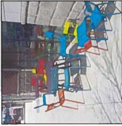
Bright colors provide visual interest and a playful character; seating is also provided for children.